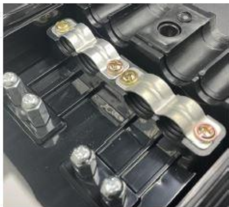
( A )