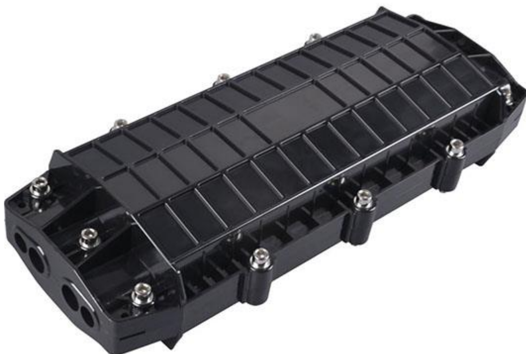
96 Core Optic Splice Joint Closure Horizontal Types 4 in 4 out F015

96 Core Optic Splice Joint Closure Horizontal Types 4 in 4 out F015 are used to distribute, splice, and store the outdoor optical cables which enter and exit from the ends of the closure. There are two connection ways: direct connection and splitting connection. They are applicable to situations such as overhead, man-well of pipeline, embedded situation etc. Comparing with terminal box, the closure requires much stricter requirement of seal.