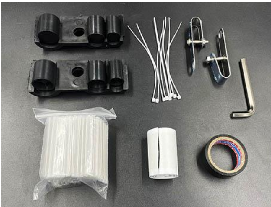
Accessories 96 Core Optic Splice Joint Closure Horizontal Types 4 in 4 out F015