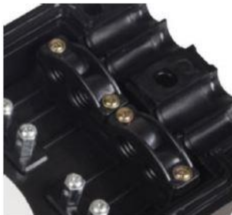
( B )