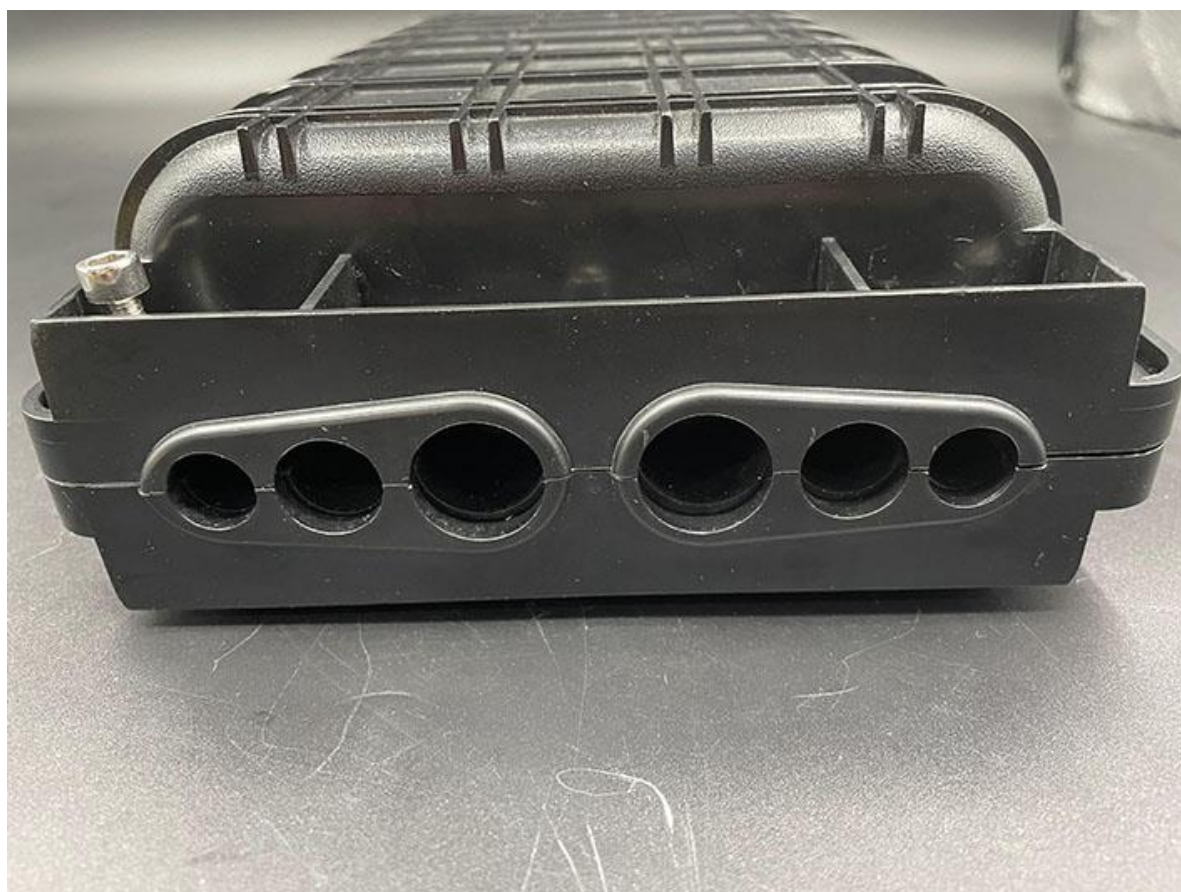
96 Core Optic Splice Joint Closure Horizontal Types 3 in 3 out F005

96 Core Optic Splice Joint Closure Horizontal Types 3 in 3 out F005 are used to distribute, splice, and store the outdoor optical cables which enter and exit from the ends of the closure. There are two connection ways: direct connection and splitting connection. They are applicable to situations such as overhead, man-well of pipeline, embedded situation etc. Comparing with terminal box, the closure requires much stricter requirement of seal.