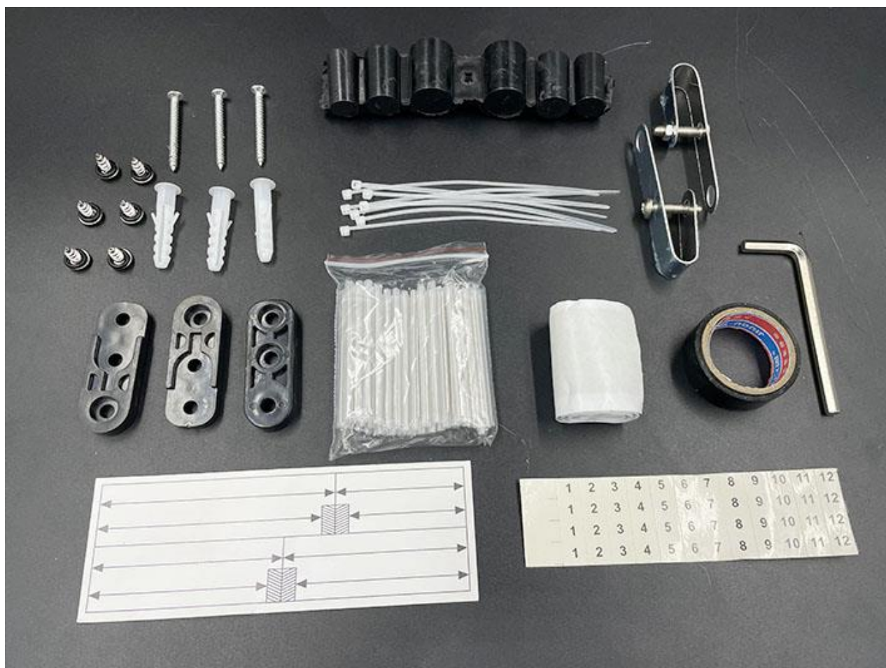
96 Core Optic Splice Joint Closure Horizontal Types 3 in 3 out F005 Accessories