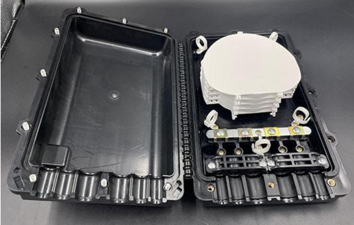
96 Core Optic Splice Joint Closure Horizontal Types 3 in 3 out F005

Horizontal fiber optic splice closures are designed to be waterproof and dust proof. They have good adaptability and compression resistance, for they are commonly made of high tensile construction plastic. If attached to a pole or hung from wiring, these fiber splice closures need to be held firmly in place, to avoid damage from weather and wind.