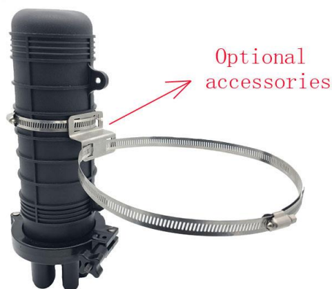
48 Core Optic Splice Joint Closure Dome-Vertical Heat shrink seal Types

48 Core Optic Splice Joint Closure Dome-Vertical Types Heat shrink seal 1 in 3 out F105H are used to distribute, splice, and store the outdoor optical cables which enter and exit from the ends of the closure . There are two connection ways: direct connection and splitting connection. They are applicable to situations such as overhead, manwell of pipeline, embedded situation etc. Comparing with terminal box,the closure requires much stricter requirement of seal. Sealing ring and air valve are required for closure, but that are not necessary for terminal box.