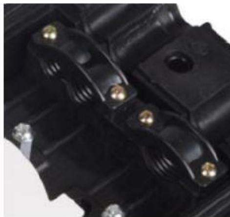
( B )