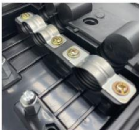
( A )