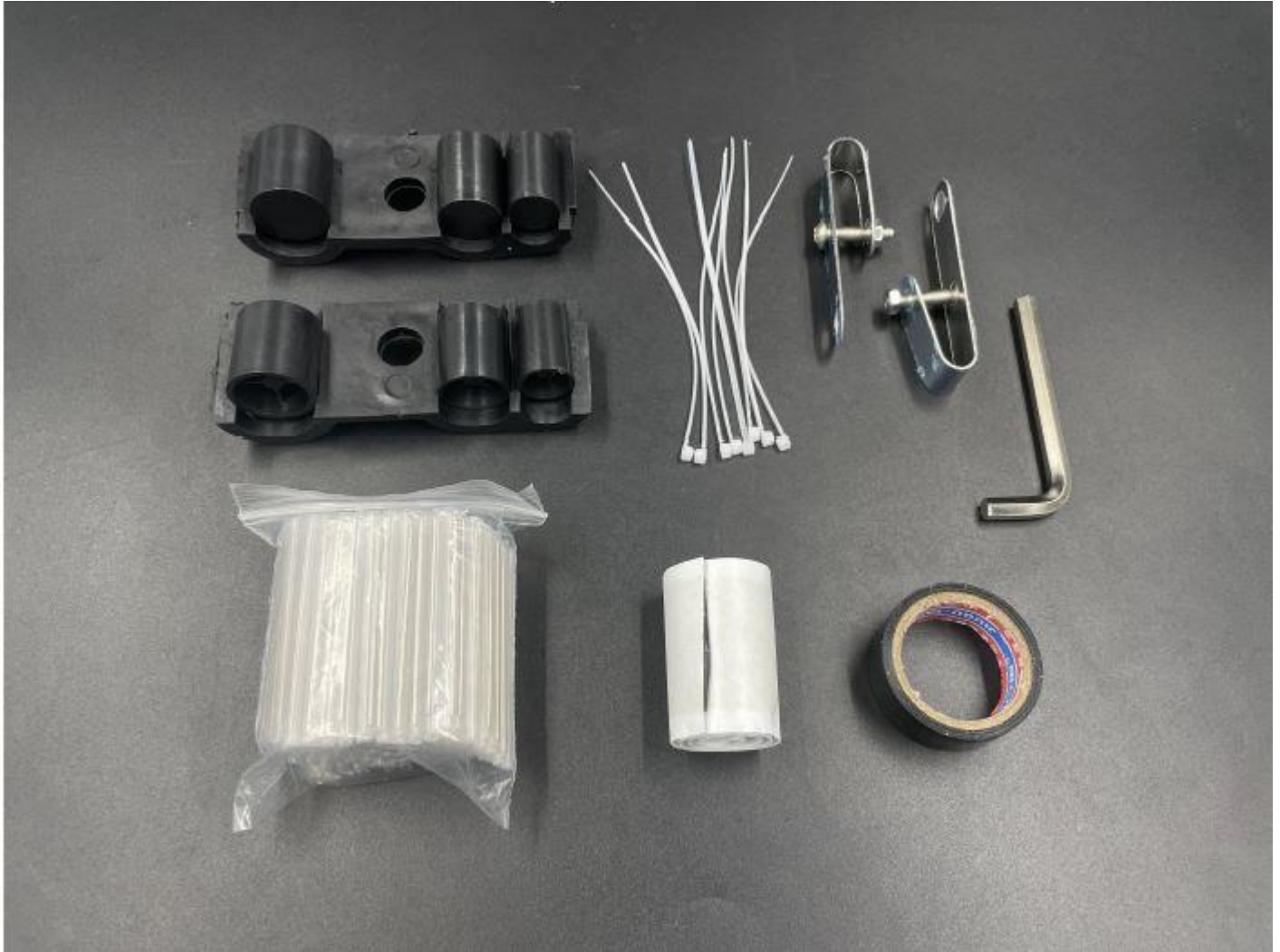
Accessories 144 Core Optic Splice Joint Closure Horizontal Types 3 in 3 out F014