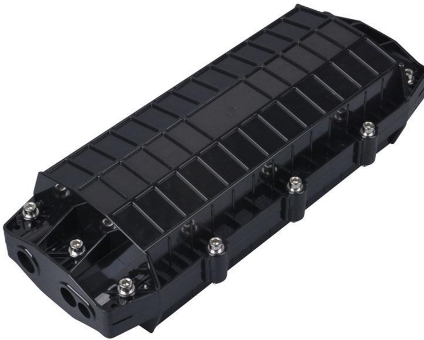
144 Core Optic Splice Joint Closure

144 Core Optic Splice Joint Closure Horizontal Types 3 in 3 out F014 are used to distribute, splice, and store the outdoor optical cables which enter and exit from the ends of the closure. There are two connection ways: direct connection and splitting connection. They are applicable to situations such as overhead, man-well of pipeline, embedded situation etc. Comparing with terminal box, the closure requires much stricter requirement of seal.